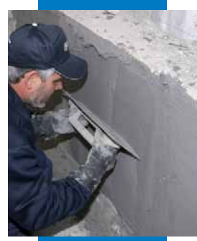
Application of Nivoplan with a float