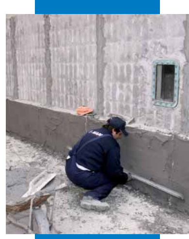
Levelling off the render with a straight-edge

Please refer to the current version of the Technical Data Sheet, available from our website www.mapei.com